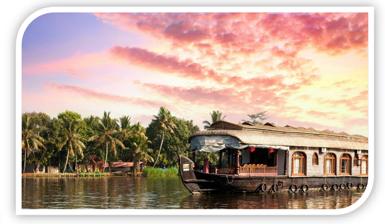
Day: 6 Trivandrum

Jatayu Earth's Center Nature Park. Jatayu nature park holds the distinction of having the worlds larges