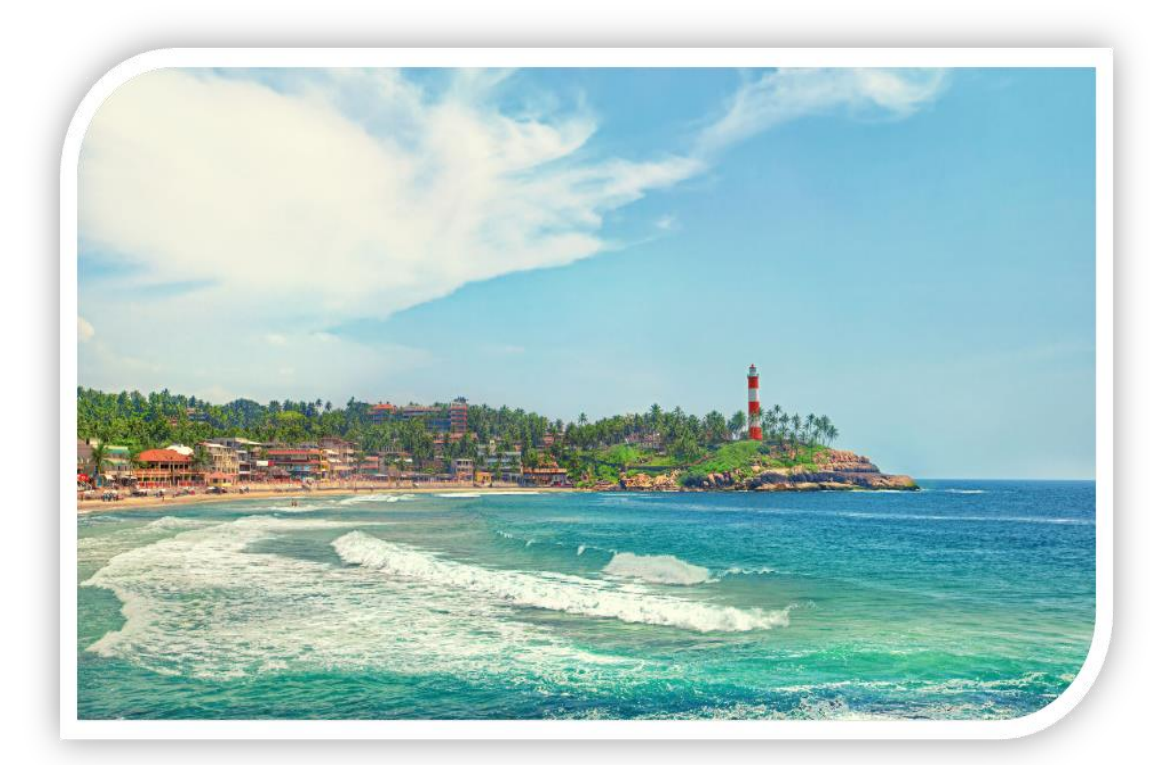
Day: 8 Trivandrum

Padmanabhaswamy Temple, chitra art gallery, trivandrum zoo Kovalam - breathtakingly beautiful - a haven of peace and tranquillity - the idyllic tourist destination in God's own country. Kovalam offers an excellent diversity with Kovalam beach to suit all desires and occasions. Visit light house beach and Hawah beach. Overnight stay at the hotel.